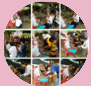
Ask for blessing from elders in Songkran Festival