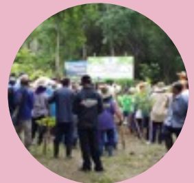
Supported forestation of local community