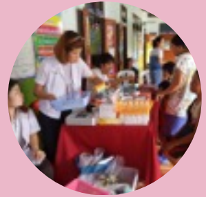
Provided Community Health Check up

Furthermore, SBANG has supported local agencies to develop their projects which help to support promotion of agricultural improvement that enhance farmers' livelihood and income.